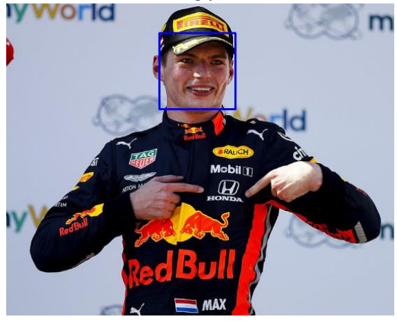
Fig 6. Face recognition Output