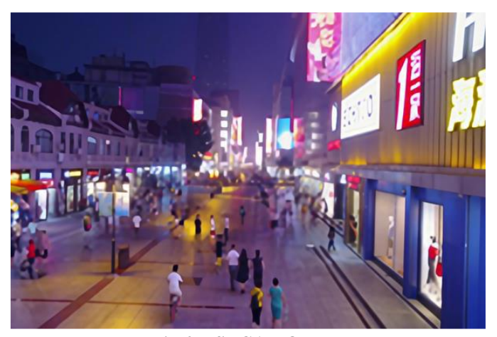
Fig 4. ESRGAN Output